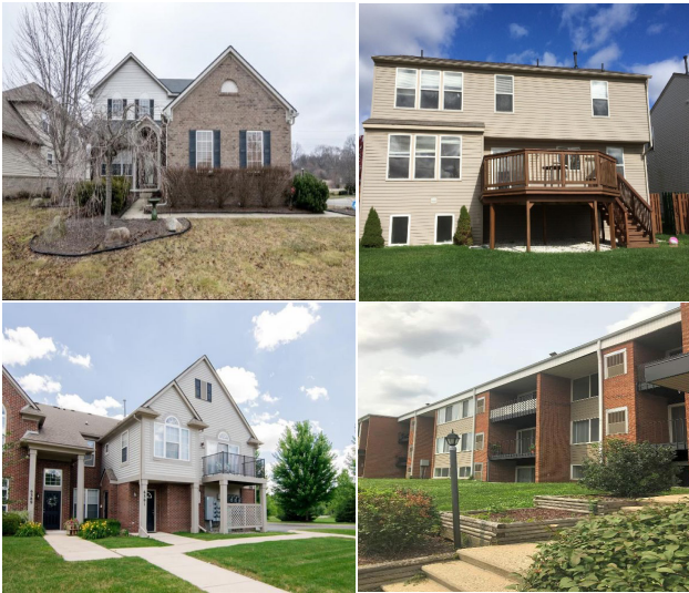
Exhibit 14. Images of houses without garages in Ypsilanti

However, the parking area of the houses mentioned in exhibit 2 includes the garage space and the remaining lot. The above mentioned, houses have the garage spaces, so the autonomous vehicles can park in those spaces as there is not much change in that. In contrast, there are many houses in the Ypsilanti region without garage spaces or lots and therefore they must park their vehicles on the streets. If this is the scenario, then there is a need or separate parking structures for the autonomous vehicles to park. Exhibit 14 illustrates the houses without garage spaces.