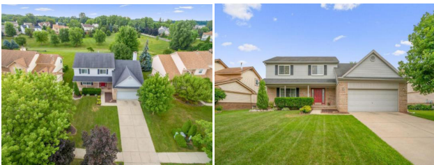
Exhibit 5. Images of 3855 Palisades Boulevard, Ypsilanti

House 3: 3855 Palisades Boulevard, Ypsilanti: The total area of the house is 1985 square feet and a parking lot of 11324.6 square feet which is utilized by 2 parking space. A garage must have a minimum height of 8’2” and parking space width between 8’6” and 9’0” wide. So, as per the calculation Approximately 1000 square feet is enough for 2 parking spaces and rest of the area can be utilized for other purposes. Autonomous vehicles can use the same parking space, or they can prefer separate parking structures, it depends on the owner of the vehicle. Exhibit 5 illustrates the parking space for mentioned space.