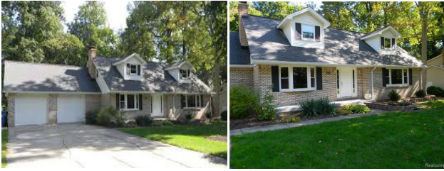
Exhibit 3. Images of 3315 Oak Drive, Ypsilanti

Note: (URL1, 2020, https://images.app.goo.gl/cNnzWTsDkx8P6Jty8 )