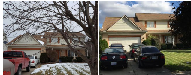
Exhibit 6. Images of 3999 Palisades Boulevard, Ypsilanti

total area of the house is 1968 square feet and a parking lot of 13939.2 square feet which is utilized by 2 parking spaces. As per the fundamentals, an area of 350 square feet is enough for a single parking space. So, an area of 700 square feet is enough for 2 parking spaces. For convenient mobilization the total can be sum up to approximately 1000 square feet. However, there will be no change in the structure of autonomous vehicles, they can utilize the same space for their parking. Autonomous vehicles prefer separate parking spaces other than the regular garage space, but it depends on the location. Exhibit 6 illustrates the parking space for the mentioned house.