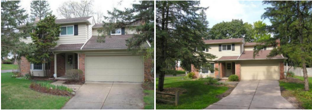
Exhibit 8. Images of 2454 Midvale street, Ypsilanti

Note: (URL6, 2020, https://images.app.goo.gl/CD88vbUxtzUeXuM37 )