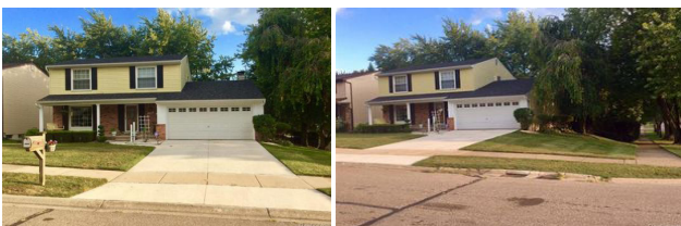
Exhibit 10. Images of 2333 Draper Avenue, Ypsilanti

House 8: 2333 Draper Avenue, Ypsilanti: The total area of the house is 1803 square feet and a parking lot of 11325.6 square feet which is utilized by 4 parking spaces. Dimensions of 9’*18’ and 24’ width are the standards of parking which imply that 1000 square feet of building requires a minimum of 1080 square feet for parking area. By calculation, an area of 1600 square feet is enough for 4 parking spaces and the rest of the area can be utilized for other purposes. Exhibit 10 illustrates the parking space for the mentioned house.