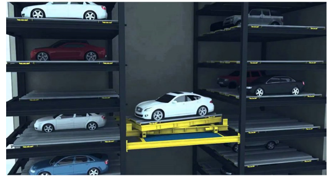
Exhibit 15. A model of Autonomous parking structure

parking zones or collective garages will show up or be created, as just right now autonomous vehicles be ensured to find a space in the neighbourhood-defined catchment zone. It is additionally expected here that sufficient parking limit will be given to permit vehicles to find a space securely and dependably. Exhibit 15 shows the autonomous parking system that is expected to have in future.