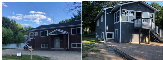
Exhibit 12. Images of 2525 Eastlawn Street, Ypsilanti

House 10: 2525 Eastlawn street, Ypsilanti: The total area of the house is 1555 square feet and a parking lot of 10454 square feet which is utilized by 4 parking spaces. Dimensions of 9’*18’ and 24’ width are the standards of parking which imply that 1000 square feet of building requires a minimum of 1080 square feet for parking area. By calculation, an area of 1600 square feet is enough for 4 parking spaces and the rest of the area can be utilized for other purposes. Exhibit 12 illustrates the parking space for the mentioned house and Exhibit 13 illustrates the area distribution of the mentioned houses.