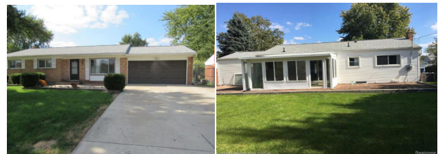
Exhibit 7. Images of 3848 Golf-Side Road, Ypsilanti

House 5: 3848 Golf-side road, Ypsilanti: The total area of the house is 1222 square feet and a parking lot of 11761.2 square feet which is utilized by 2 parking spaces. Dimensions of 9’*18’ and 24’ width are the standards of parking which imply that 1000 square feet of building requires a minimum of 1080 square feet for parking area. By calculation, an area of 1200 square feet is enough for 2 parking spaces and the rest of the area can be utilized for other purposes. Exhibit 7 illustrates the parking space for the mentioned house.