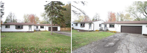
Exhibit 9. Images of 2420 Merrill Street, Ypsilanti

House 7: 2420 Merrill Street, Ypsilanti: The total area of the house is 1399 square feet and a parking lot of 14374.8square feet which is utilized by 2 parking spaces. As per the fundamentals, an area of 350 square feet is enough for a single parking space. So, an area of 700 square feet is enough for 2 parking spaces. For convenient mobilization the total can be sum up to approximately 1200 square feet. However, there will be no change in the structure of autonomous vehicles, they can utilize the same space for their parking. Autonomous vehicles prefer separate parking spaces other than the regular garage space, but it depends on the location. Exhibit 9 illustrates the parking space for the mentioned house.