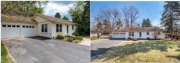
Exhibit 4. Images of 3731 Hillside Drive, Ypsilanti

House 2: 3731 Hillside Drive, Ypsilanti: The total area of the house is 1232 square feet and a parking lot of 13068 square feet which is utilized by 4 parking spaces. Dimensions of 9’*18’ and 24’ width are the standards of parking which imply that 1000 square feet of building requires a minimum of 1080 square feet for parking area. By calculation, an area of 1500 square feet is enough for 4 parking spaces and the rest of the area can be utilized for other purposes. Exhibit 4 illustrates the parking space for the mentioned house.