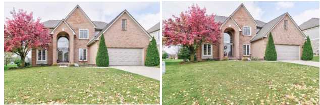
Exhibit 11. Images of 4110 Silverleaf Drive, Ypsilanti

House 9: 4110 Silverleaf Drive, Ypsilanti: The total area of the house is 2620 square feet and a parking lot of 13068 square feet which is utilized by 4 parking space. A garage must have a minimum height of 8’2” and parking space width between 8’6” and 9’0” wide. So, as per the calculation Approximately 1600 square feet is enough for 4 parking spaces and rest of the area can be utilized for other purposes. Autonomous vehicles can use the same parking space, or they can prefer separate parking structures, it depends on the owner of the vehicle. Exhibit 11 illustrates the parking space for mentioned space.