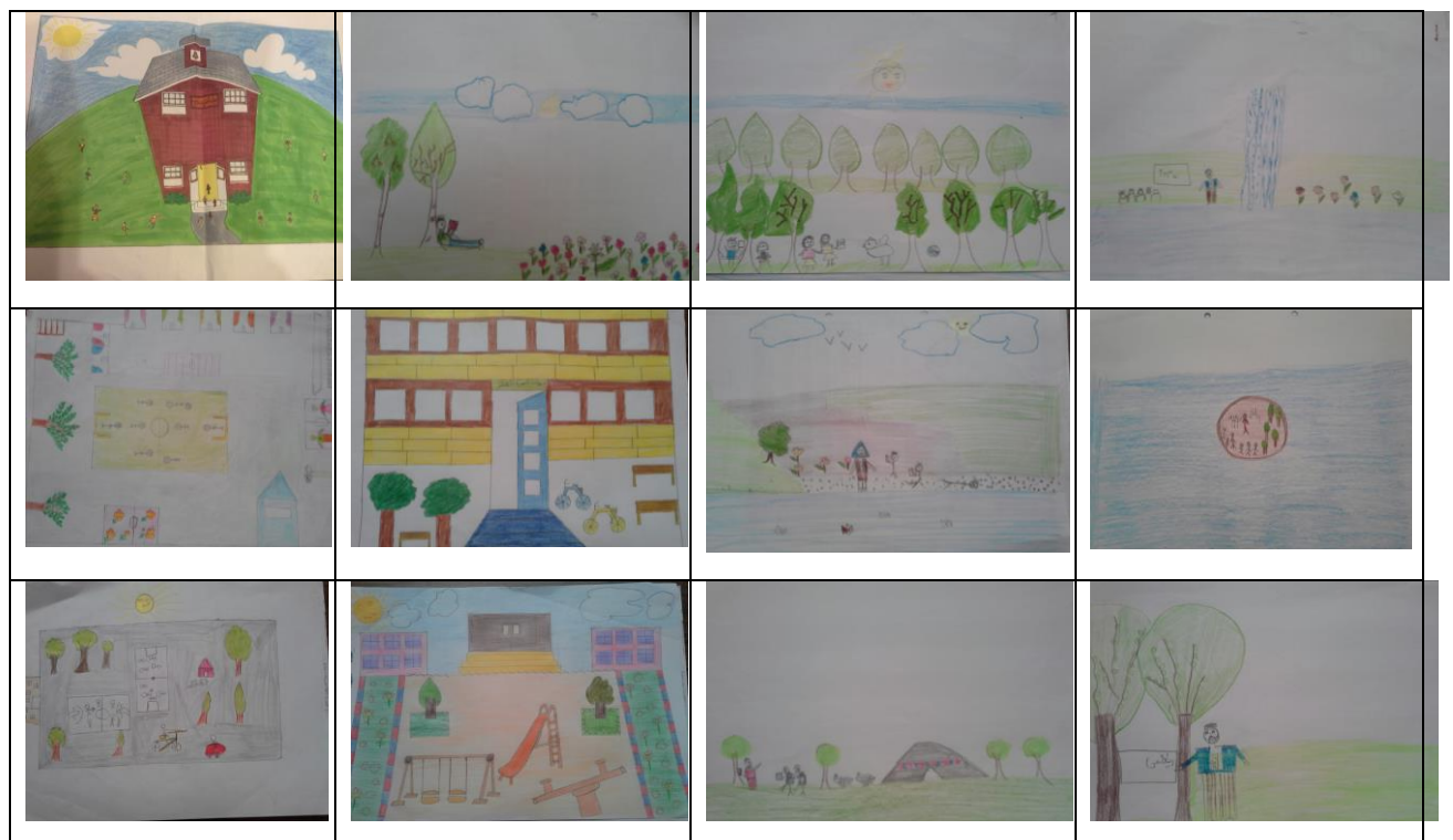
Table 1: Children's Illustration of their favourite class during their course of study

These results are consistent with findings of similar researches [17,18,19,20] about children who experience their need to space, light and colour in the open space. The key features of an ideal and effective classroom learning of the children include: Playground with framework for climbing, tree houses for classes in the quiet space with water sound, musical sound of nature instead of bells, colourful place for painting, reading and outdoor games, greenhouses for growing fruit and vegetables for consumption and selling them to make money, creative environment full of colourful flowers and large green spaces, oxygen-rich atmosphere [21]. These listed issues are parallel with different climatic conditions of Shiraz. According to the students' experience of the class as well as natural environment, they imagine their favourite learning environment in outdoors which is active and full of trees and relaxing. This reflects the desire for children to learn outside of the boring and frustrating classroom. This has been promoted in other countries by educational fans such as the Experiential Learning Centre of John Dewey in America, Neil summer hill school in England, Ivan Illich's de schooling movement [22].