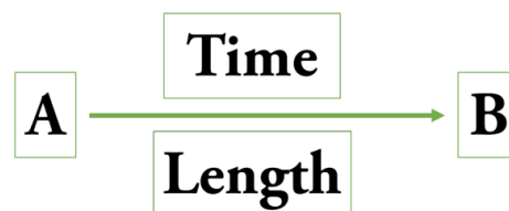
Figure 2. Pedestrian speed determination mechanism (Author)

and without the intervention of the researcher, so that in 2 summer days on Sunday, September 1, 2018 and on Tuesday, September 4, 2018, 60 people in each from the selected scenes of Valiasr Street in Tehran, walking on different types of flooring (different in terms of dimensions and form) was selected. The selection of these people was such that, at different distances of 20, 25, 40, 50 and 120 Meters and dimensions (15 * 15, 30 * 30 and 50 * 50 cm) and different forms of pre-determined flooring, 10 subjects were selected for each type of flooring in each of the distances, and using the behavioral method. A movement was recorded to record the amount of time the pedestrian needed to travel the specified distances, and then the average speed of each pedestrian was recorded by analyzing the numbers obtained. And was analyzed in relation to the form and dimensions of flooring.