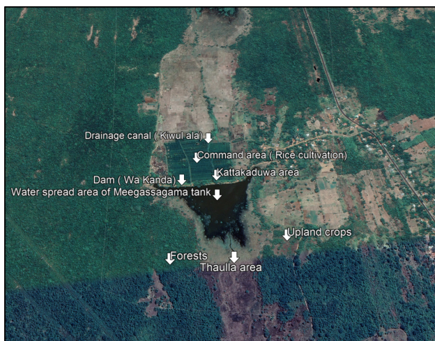
Figure 2. Part of Thirappane tank cascade showing Meegassagama tank and its prominent components ( Google Earth map taken during dry season)