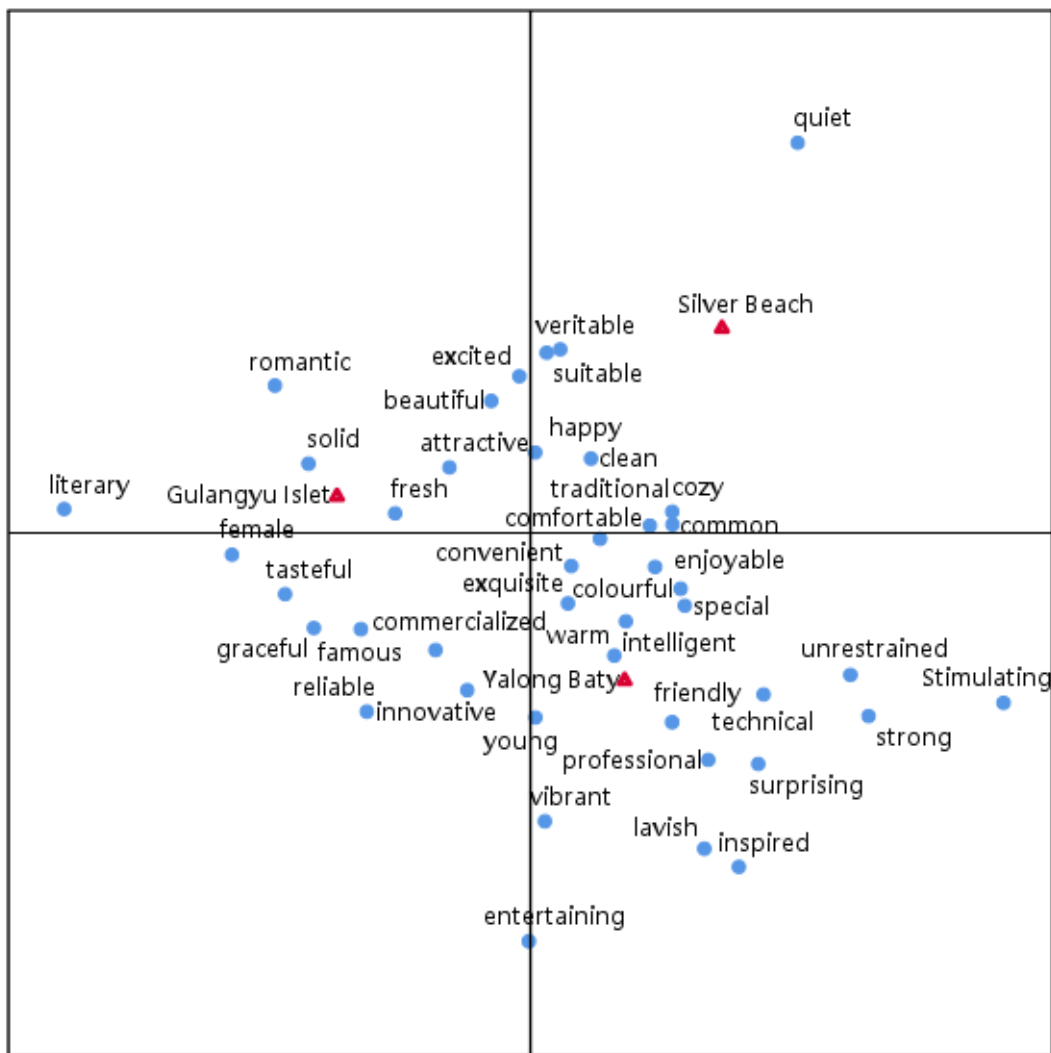
Figure 2. Correspondence analysis of brand personality of 3 coastal tourism destinations