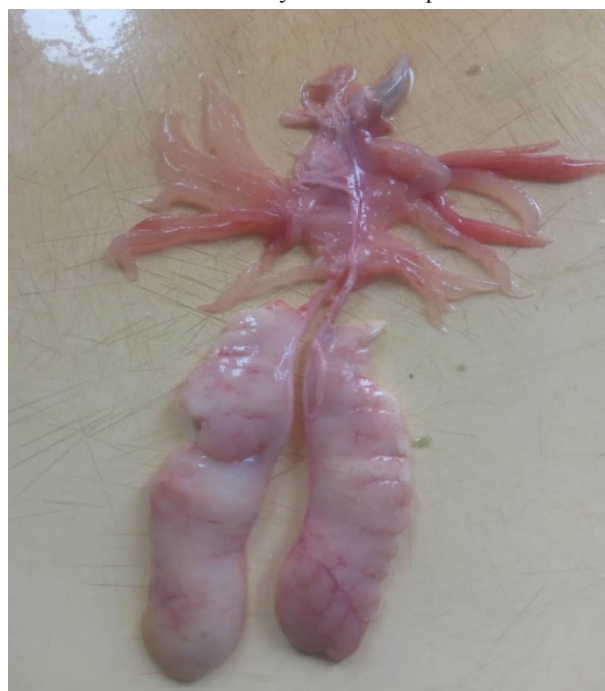
Plate 1. The milt or gonads of Clarias gariepinus

It is necessary to sacrifice male brood fish or surgically removed part of their testes in order to obtain the fish spermatozoa. Thus, male broodstocks of African Catfish, Clarias gariepinus collected for the study were dissected via the abdomen and the gonads were removed using standard laboratory method. However, blood clots and other tissues were rinsed away. The gonads were placed in the buffer solution prior to maceration to maintain its potency. Gonads were macerated in Petri dish and semen was transferred into freshly labeled sample bottles.