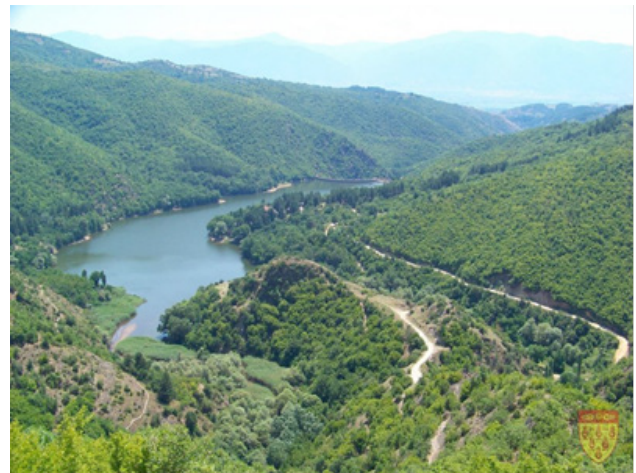
Figure 1. Gradche Reservoir

This study aimed to determine the parasite fauna in common carp ( Cyprinus carpio , L. 1758) from the Gradche Reservoir (Macedonia) (Figure 1). The Gradche Reservoir is located on Kochanska River near the village Dolno Gradche, 6 km north of Kochani. The dam is reinforced concrete, with a height of 32 m, length of the crown of 150 m, and elevation of 467 m above sea level. The Gradche Reservoir is 3.5 km long, 0.2 km wide, with a maximum depth of 29 m. The area of the Reservoir is 0.19 km 2 , with a volume of 2.4 million m 3 of water used for the water supply of the population of Kochani and irrigation of about 5761 ha of arable land in Kochansko Pole.