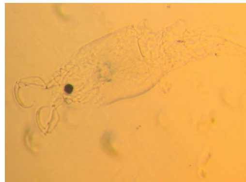
Figure 2. Ergasilus sieboldi (whole parasite) on gills in common carp ( Cyprinus carpio ) from Gradche reservoir (original)

According to data from the previous parasitological research in Macedonia, Ergasilus sieboldi was identified in Alburnus albidus alborella from Lake Ohrid [8] . Ergasilus sieboldi was identified in the following fish species of natural lakes in Macedonia: Leuciscus cephalus albus , Barbus meridionalis petenyi , Alburnus albidus alborella , Scardinius erythrophthalmus , Rutilus rubilio , Pachychilon pictus , Barbus cyclolepis prespensis , Alburnus alburnus belvica , Alburnoides bipunctatus prespensis and Tinca tinca [17-19] . Ergasilus sieboldi was found in common carp from Tikvesh Reservoir [20] . According to literary reviews from surrounding countries and the world, the presence of Ergasilus sieboldi in common carp was determined in waters in Serbia [21] , in fishponds in the Czech Republic [22] , in fishponds in Iraq [23] , and in fishponds in Iran [24] . In Turkey, data on the appearance of Ergasilus sieboldi in common carp were published from Lake Iznik [25,26] , from the Dalyan Lagoon [27] , and from the Lake Karacaören Dam [28] .