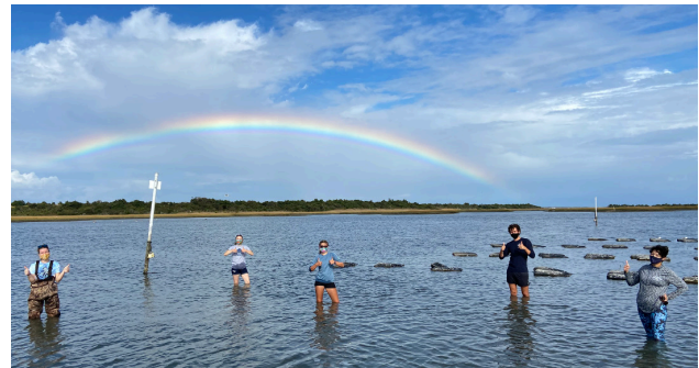
Figure 6. Part of the next generation of environmental scientists and restoration ecologists. The next cohort of environmental leaders is knowledgeable and dedicated and found all over the globe. They provide hope in turbulent times.

(Figure 6). Future leaders require both ways of knowing and the ability to synthesize practical solutions.