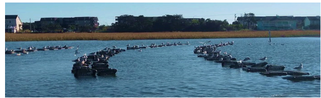
Figure 4. Floating Aquaculture on a lease in Atlantic Beach NC. Floating oyster Crasostrea virginica aquaculture provides a new hybrid ecosystem. Each floating bag contains 200 to 300 triploid or diploid oysters. Growth to market sized oysters from spat placed in bags in August is 6 to 8 months. (photo Thomas F. Schultz).

the biofouling community found in the top 30 cm growing on floating objects and a subset of natural reef community members that enter bags as propagules or small swimming juveniles. In Beaufort NC and around the globe in temperate and tropical harbors about 95% of biofouling organisms are invasive species, many of which arrived with boats and trade before or with the first European settlers [51-53] . Though found in the immediate coastal ocean [24] biofouling communities are particularly adapted to live in polluted harbors [54] . The combined oyster reef community and biofouling community in a bag provides physical and biological ecosystem services.