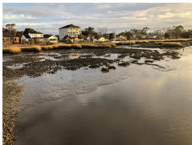
Figure 1. Crassostrea virginica , oyster reefs in a low energy stretch of Calico Creek, Newport Estuary Morehead City NC. These reefs have been undisturbed by harvest and damaged only by low frequency boat traffic, storms and runoff since 1964, about 55 years [47]. In the background and to the right are oysters reefs that have undergone succession to Sporobolus alterniflorus (= Spartina alterniflora ) by accreting sediments..

Until recently, there has been little recognition of the importance of ecosystem services associated with oyster reefs [31,37]. Australia and the UK provided a big boost to the global interest in restoration ecology when they made shellfish reef restoration a national priority [3,4,10]. Intertidal oyster reefs provide ecosystem services in lower energy sound and estuarine environments [38]. Intertidal oyster reefs extend off the substrate and undergo succession. Many details of reef communities are well studied [9]. Restoration of oyster reefs has clear societal, economic and environmental benefits especially in mediating eutrophication and acidification from human activities [11,39-45]. Compared to subtidal reefs, intertidal oyster reefs thrive in low energy polluted environments such as in a small tidal creek about a kilometer downstream of a 6.8 million liter a day sewage treatment plant (Figure 1). Food security is always a concern because pathogens, toxic metals or polychlorinated biphenyls in shellfish should not be ignored [46].