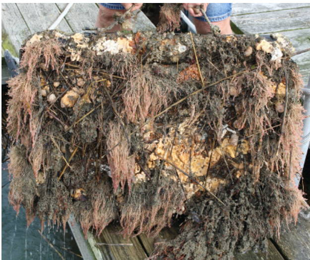
Figure 3. The robust biofouling community on the underside of an unflipped oyster bag. Oysters in the bag host oyster spat, mussels, barnacles, tube worms, ascidians, mud crabs and jingle shells and an algal turf. Growth on the outside is more extensive than on the inside. Individual oysters become clumps due to natural set in about 4 months.

The “bag ecosystem” is truly novel. It is comprised of