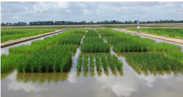
Figure 2. 280 hectares of Rice farm destroyed by flood in Iguomo in Ovia North-East of Edo state in 2018

However, high rainfall and temperature with extreme weather conditions such as drought, flooding can affect and /prevent crops from growing, reduce crop production [15] and in other instances destroy crops. In Nigeria, in almost all the rice producing state flooding resulting from excessive rainfall is a major extreme climatic event that destroys rice farms leading to destruction of several hectares of rice farms and lose of billion of naira yearly. Evidences of such climate related extreme events is shown in Figures 2-6.