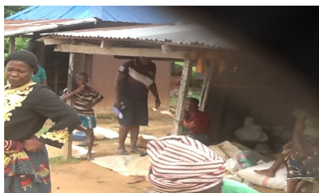
Figure 9. A local rice mill in Nigeria

The agricultural sector faces many challenges, ranging from the use of obsolete land tenure methods that deprive farmer from having access to adequate land (1.8 ha/farming household), less use of artificial source of water supply to make up for shortfall in rainfall, non implementation of research recommendation and obsolete machinery,