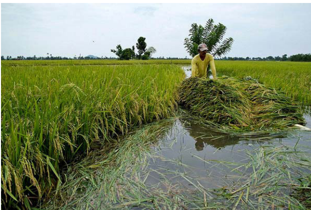
Figure 3. 1000 hectares of rice farm destroyed by flood in Katsina State in 2018