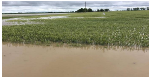
Figure 5. 5,000 hectares of rice farm destroyed by flood in Kano State in 2018