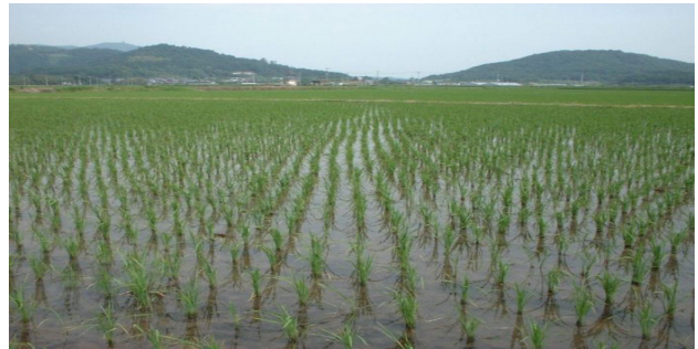
Figure 4. 200 hectares of rice farm destroyed by flood in Anambra state in 2018