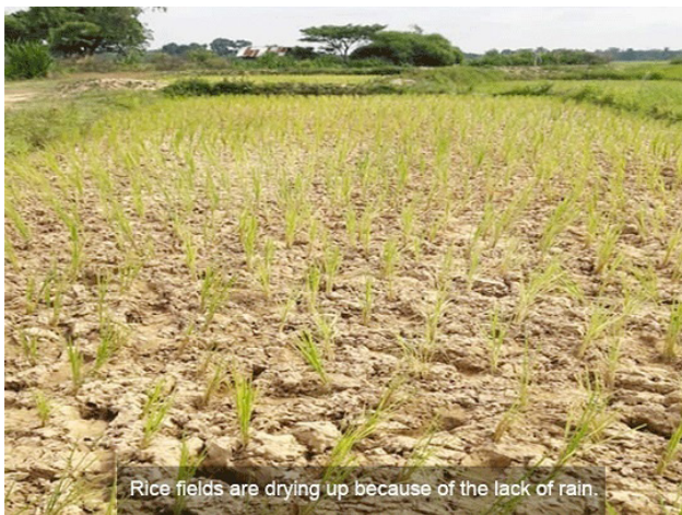
Figure 7. Drought affected rice farm in Northern Nigeria

and in some cases persist for a longer time than usual. In Africa, some countries have suffered the worst kind of drought in the last decade notable among these countries are Rwanda, Kenya, Somalia, Ethiopia amongst other. [27] stated that over 70 million humans around the world are faced with hunger due to drought which is a consequent of climate change. Over the years a consistent shift in the climatic and weather conditions in Nigeria and specifically in northern Nigeria has become evident. This could be as a result of the general variability in the global climatic conditions due to global warming. For example, the onset of the rainy season on the average is normally expected to start in Northern Nigeria between late March and April, but the recent weather condition shows a deviation from this trend. As a consequent of this changes in the climatic condition of Northern Nigeria some part are now faced with drought. (Figure 7&8) this particularly has consequences for the Nigeria nation as the geographical northern region of the country is where majority of food crops are grown.