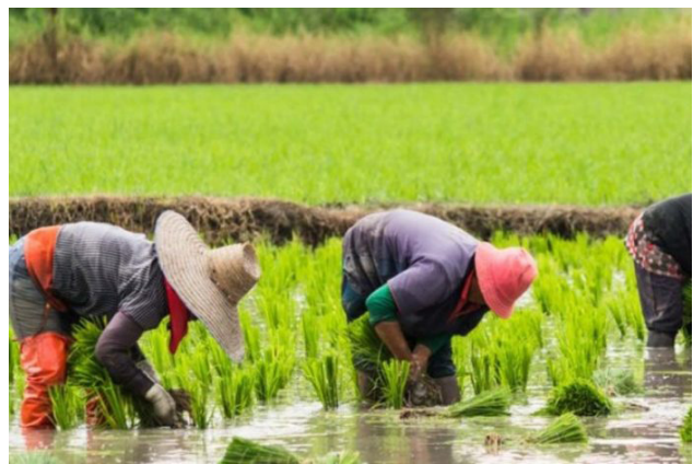
Figure 6. 4,000 hectares of rice farm submerged by flood in Maiduguri in 2018

Climate change threatens the capability of many nations, especially in Africa to guarantee global food security, poverty elimination and actualize sustainable development. Food security is a situation where all human beings, consistently have access to a reasonable amount of affordable, healthy food that is able to meets their dietary needs and the type of food they prefer for a functioning and healthy life [25]. [26] has warned that hunger in Africa is made worse by the effect created on agriculture by climate change. For example, the occurrence of drought is now a common happening in some part of the world,