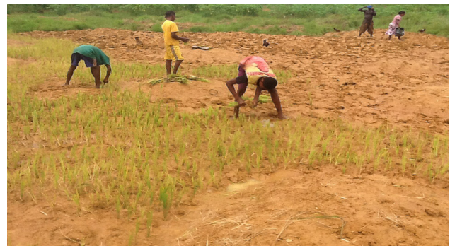
Figure 1. Rice crop requires water at every stage of development

Climate has a direct impact on the physical development of all stages of rice formation and growth. Changes in climate could also affect yield as well as growth of rice as a result of temperature and carbon dioxide. Rice plant is also affected indirectly by climate change through the occurrences of crop pests and diseases which prevent grain yields. The climatic environment in which rice grows is very important for attaining food security all over the world. Additionally, other activities that could influence rice yield are availability of irrigation water, competition with animals, changes in the fertility of soil and erosion. Changes in climate is creating an increased demand on the food supply structure of the world. Climate change is anticipated to cause an increase of food grain yield in some areas at higher latitude and cause a decline in yield at lower latitude [18] . The production of rice is faced with a lot of challenges resulting from global warming which has led to shortage of water and brought about other factor that incapacitate the ability of farmers to grow rice crop optimally. (e.g., [19-21] )