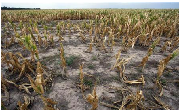
Figure 8. Rice farm affected by drought

Therefore, the susceptibility of rice crop to global