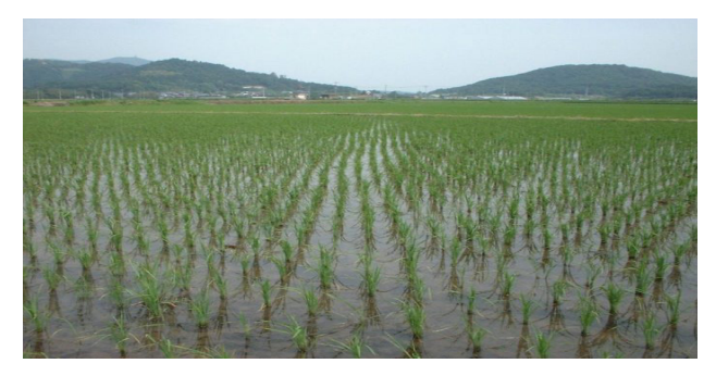
Figure 4. 200 hectares of rice farm destroyed by flood in Anambra state in 2018