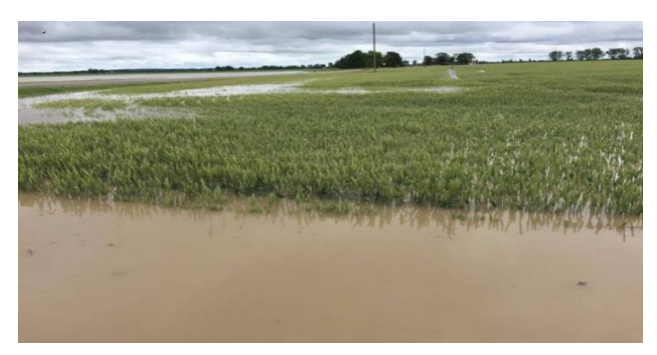
Figure 5. 5,000 hectares of rice farm destroyed by flood in Kano State in 2018