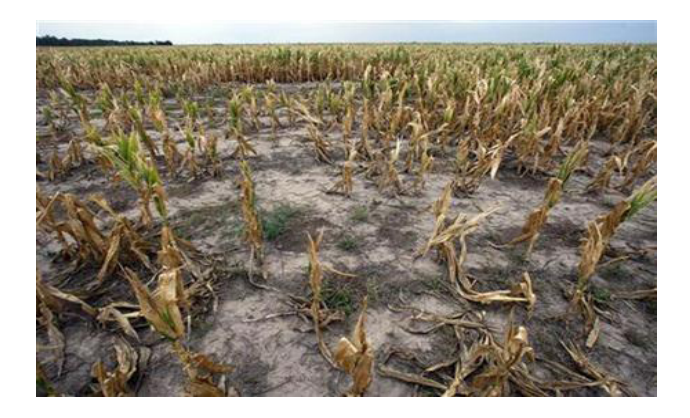
Figure 8. Rice farm affected by drought Therefore, the susceptibility of rice crop to global

warming has become of key concern with current reality of its importance to the society and the attainment of food security.