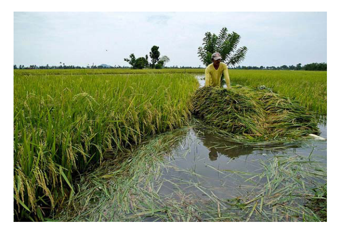
Figure 3. 1000 hectares of rice farm destroyed by flood in Katsina State in 2018