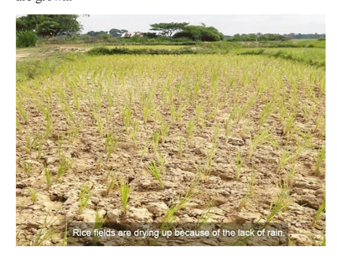
Figure 7. Drought affected rice farm in Northern Nigeria

and in some cases persist for a longer time than usual. In Africa, some countries have suffer the worst kind of drought in the last decade notable among these countries are Rwanda, Kenya, Somalia, Ethiopia amongst other. [27] stated that over 70 million humans around the world are faced with hunger due to drought which is a consequent of climate change. Over the years a consistent shift in the climatic and weather conditions in Nigeria and specifically in northern Nigeria has become evident. This could be as a result of the general variability in the global climatic conditions due to global warming. For example, the onset of the rainy season on the average is normally expected to start in Northern Nigeria between late March and April, but the recent weather condition shows a deviation from this trend. As a consequent of this changes in the climatic condition of Northern Nigeria some part are now faced with drought. (Figure 7&8) this particularly has consequences for the Nigeria nation as the geographical northern region of the country is where majority of food crops are grown.