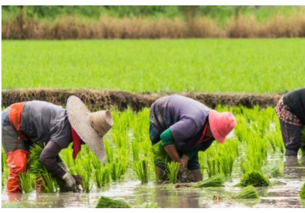
Figure 6. 4,000 hectares of rice farm submerged by flood in Maiduguri in 2018

Climate change threatens the capability of many nations, especially in Africa to guarantee global food security, poverty elimination and actualize sustainable development. Food security is a situation where all human beings, consistently have access to a reasonable amount of affordable, healthy food that is able to meets their dietary needs and the type of food they prefer for a functioning and healthy life [25]. [26] has warned that hunger in Africa is made worse by the effect created on agriculture by climate change. For example, the occurrence of drought is now a common happening in some part of the world,