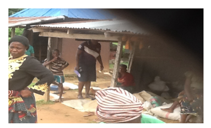
Figure 9. A local rice mill in Nigeria

The agricultural sector faces many challenges, ranging from the use of obsolete land tenure methods that deprive farmer from having access to adequate land (1.8 ha/farming household), less use of artificial source of water supply to make up for shortfall in rainfall, non implementation of research recommendation and obsolete machinery,