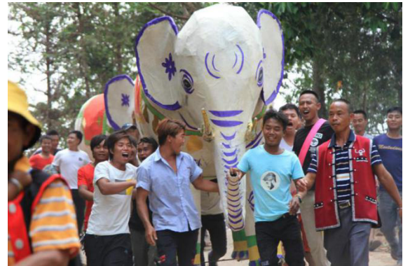
Figure 3. During the "Elephant Worshipping Festival", people push the white elephant through the streets

Human behaviors are strongly guided and regulated by these rich and colorful elephant cultures, thus promote people to protect elephants and their habitats consciously [6] . For instance, the forest where elephants live in is regarded as "the God's Forest" forbidding to be cut. Hunting elephant is strictly prohibited in any time and anywhere. In order to avoid disturbing elephants, on the "Elephant Day", all villagers are forbidden to enter any mountain, even cultivate in their own farmland. Whether wildlife could chronically survive in a region mainly depends on attitudes and behaviors of the locals who co-existing with them [12] , besides protective efforts of the national and local government. From the ancient times to now, with various positive and significant impacts, elephant culture has played a vital role in protection of Asian elephant. It can protect elephants well, especially in the case of weak protection by local governments, and ultimately slow down the extinction of this endangered species in China.