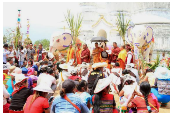
Figure 2. The Wa people pray for the blessing of elephants during the “Elephant Worshipping Festival”

Among these 30 people, only one is not an ethnic minority, the others include 27 Wa and 2 Dai. And the results of the survey showed that only one Wa teenagers was not concerned about elephant conservation, and all of the others were willing to protect elephants voluntarily, we also found that attitudes toward elephant conservation had nothing to do with the education of the people we interviewed.