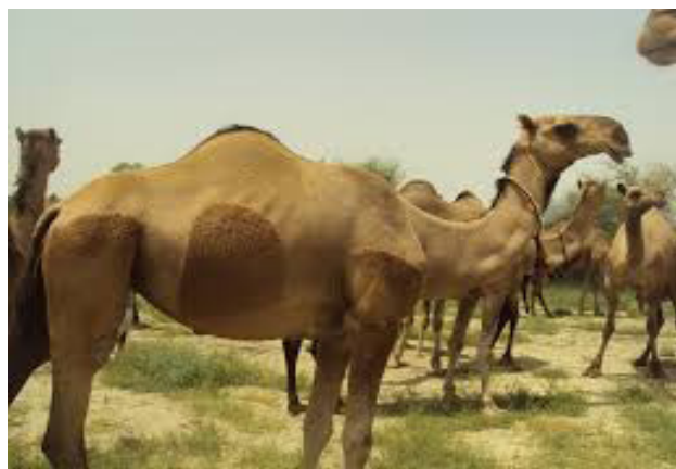
Figure 3. Barela (Thalochi) camel of Punjab, Pakistan

Camel farming could be practiced as commercial dairy farming in the areas of Thal and Thar Deserts and Cholistan rangelands. Camel milk is consumed as such and also with some value additions in Pakistan. Tea, yogurt, lassi (whey proteins) are also made from camel milk. Camel milk has different sensory characteristics. Pakistani camels qualify to be a good dairy animal as it has all prominent dairy features. By the adoption of modern husbandry practices; camel could be the valuable source for future food production especially in arid, semi-arid, mountainous and deserted areas. Average milk production per lactation of Pakistani camel is reported as 2920 kg with per day yield of 8 kg in extensive conditions [10] (Table 2).