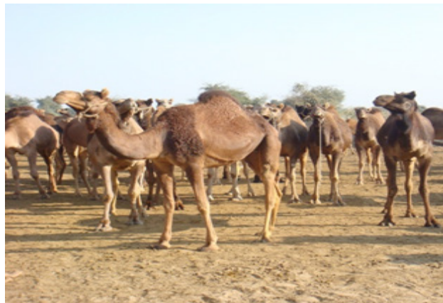
Figure 2. Marecha (Mahra) camels of Punjab, Pakistan

while concentration of protein, fat, minerals and vitamins is almost same like cow milk [14-16] . Camel milk is superior to the milk of other domestic species as it is rich in phosphorus concentrations. Camel milk has higher protective protein contents which perform an inhibitory action against certain bacteria thus has increased shelf life. It is easy to market camel milk with basic hygienic conditions even in the higher temperature [13] .