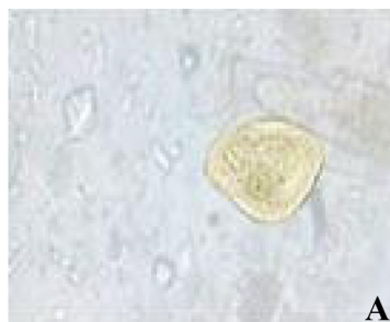
Figure 3. Micrograph of G.I cestode eggs affecting cattle in north-east Nigeria. (A) Moniezia spp. (mag. ×40)