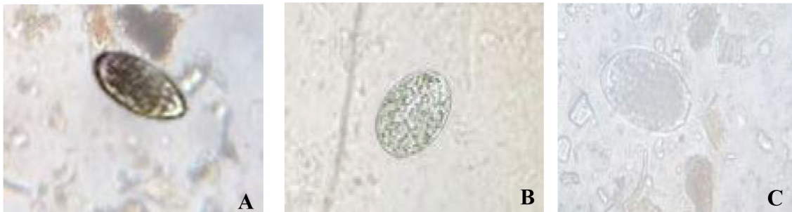
Figure 1. Micrograph of G.I nematode eggs affecting cattle in north-east Nigeria. (A) Haemonchus spp. (B) Strongyloides spp. and (C) Oesophagostomum spp. (mag. ×40)