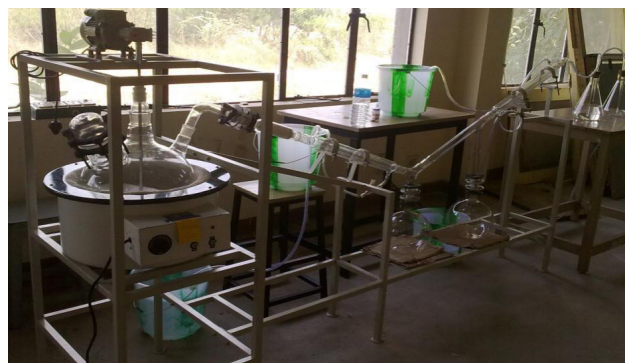
Figure 3. Waste bio-plastics to fuel production through de-polymerization

One of the foremost applications of these bio plastic and bio resin composites in their recyclability and ease of disposal through conversion of the bio-plastics in to useable fuel by de-polymerization with the aid of a catalyst and condensing the pyrolysed gas in to fuel oil .