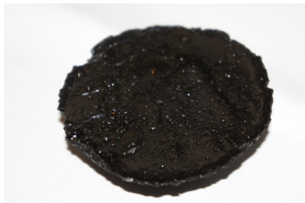
Figure 2. CNSL Resin matrix disc cured for Dielectric permittivity measurements

it eco-friendly. Figure 2 shows a CNSL nano-composite disc cured for dielectric measurements [19].