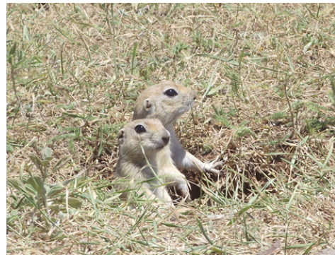
Figure 1. S. xanthoprimum from Gencali

Spermophilus xanthoprimum , Anatolian ground squirrel, is a group-living, diurnal, obligately hibernating marmotine squirrel (Figure 1). It inhabits the steppes and alpine meadows throughout central lowland and eastern highland Anatolia and adjacent Armenia and northwestern Iran. Its preferred elevation appears to range from about 800 to 2.900 m [2] .