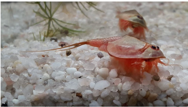
Figure 5. Domestic culture of Triops australiensis with the albino individual in the foreground

Considering rapid development, easy reproduction and economic potential, notostracans are still being studied for their role in aquaculture [8,10] . Also, because of their modest demands, interesting appearance and behaviour, tadpole shrimps are popular among breeders (Figure 5) [5,8] . Moreover, cysts of Anostraca, closely related to Notostraca, exposed to outer space vacuum, were still able to hatch and develop into young crustaceans [4] , which makes Branchiopoda a viable test subject in astrobiological experiments. Due to ease of storage (in the form of cysts) and modest needs they are a rewarding object of observation and laboratory studies, especially that they cover a multiple cryptic species [16,20] , whose identification requires in-depth morphologic and genetic analyses.