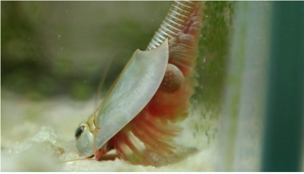
Figure 4. Triops australiensis with its egg pouch visible