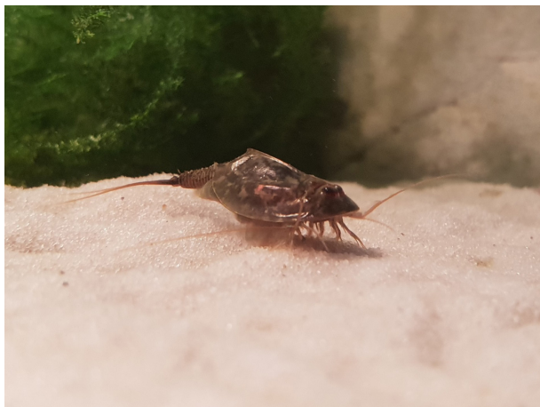
Figure 1. Triops cancriformis – member of the order Notostraca