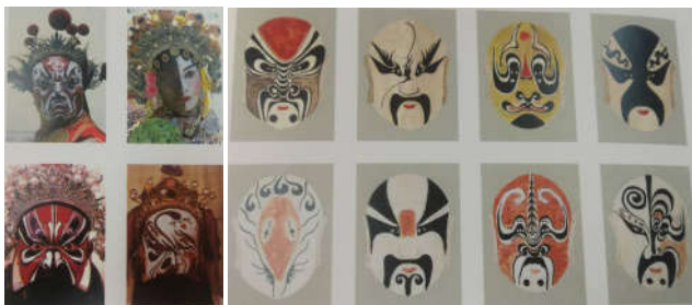
Figure 3. Kunqu’s legend for making changes to facial make-up after May fourth new culture movement, image quoted in “ Chinese opera mask art ”, Jiangxi fine arts publishing press ,p.283