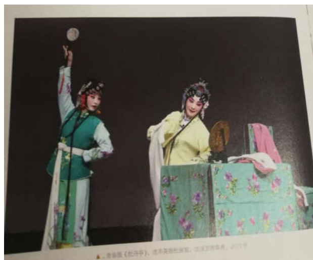
Figure 6. Peony Pavilion (Mudanting)

During this period, due to the entry into a new political structure under the leadership of Chairman Mao, the people are unconditionally supporting and advocating the leadership of the Communist Party of China in spirit, so there is little reaction to the reform and development of the opera during this period. Controversy, this period can be described as a period of transformation and revival of Kunqu .