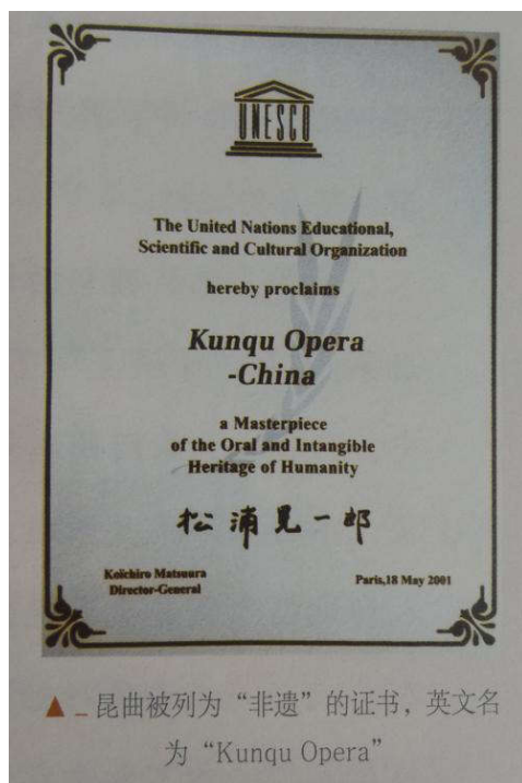
Figure 5. Image quoted in “Chinese modern opera history”, Culture and Art Press, 2011, p. 226

On May 18, 1956, “the People’s Daily published a commentator’s article”, “A play to save a play,” which is indeed one of the most important documents in the history of Kunqu since the 1940s.