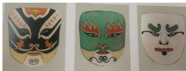
Figure 1. Image quoted in "Chinese opera mask art" Jiangxi fine arts publishing press p.187

The development of opera also changed from royal aristocratic to popular. Kunqu began to decline. [6] In the middle of the Qing Dynasty, Kunqu and other emerging operas went hand in hand, but they were no longer like the past and the pet. By the end of the Qing Dynasty, the Taiping Heavenly Kingdom had occupied Suzhou, and the Suzhou troupe had fled to Shanghai. There were few troupes left in Suzhou. Since then, the artists' creation of Kunqu has begun to fade. Afterwards, the feudal ruling class began to restrict and control Kunqu in order to imprison people's thoughts, and the influence and heat of Kunqu began to weaken.